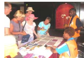
Tourists buying philatelic items at Pacific Princess

Apart from that there will be many other tourist vessels calling into the port of Rabaul. The next vessel will be MV Amadea which will arrive at Rabaul port on Wednesday - 24/03/10 and Sound Princess, another sister ship of Pacific Princess to arrive on the 8 th of April. The Kokopo RM will advise further on that.