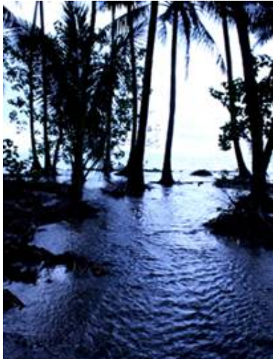
The Carteret Island

Carteret Atoll, also known as "The Carteret Island" is part of Papua New Guinea located 86 kilometres northeast of Bougainville in the South Pacific at 4°45'S, 155°24'E. Carteret Atoll incorporates a scattering of low lying islands in a horseshoe shape stretching around 30 kilometers in north-south direction, with a total land area of 0.6 square kilometers and a maximum elevation of 1.5 meters above sea level.