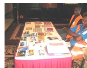
Two of the Kokopo Post Office staff showcasing Post PNG products to the tourists in the liner, Pacific Princess