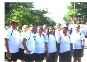
2009 Post PNG Netball Team, Runner up of Division 7.

Appeal: Family of Post PNG residing in Port Moresby are encouraged to go and support our Netball and Corporate Touch teams.